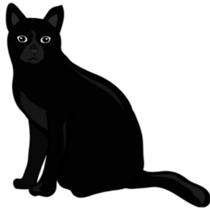
afraid of cats