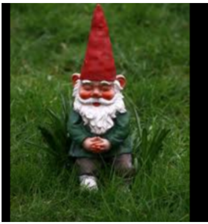
can stand still and look like a statue