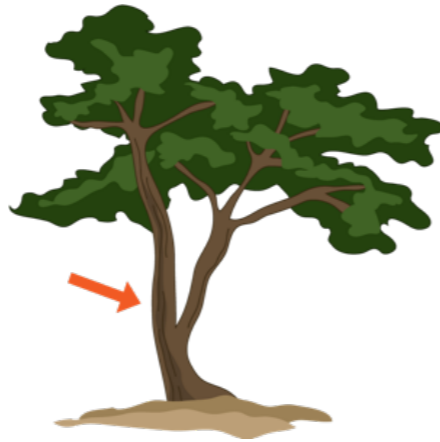
lives inside trees