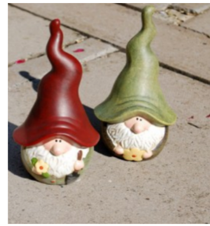
wears pointy hats