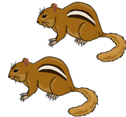
takes care of animals