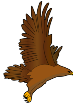
sees better than a hawk